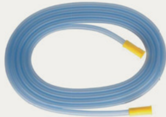
Suction Connecting Tubes